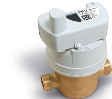
Aquadis+ equipped with the Cyble 5 module