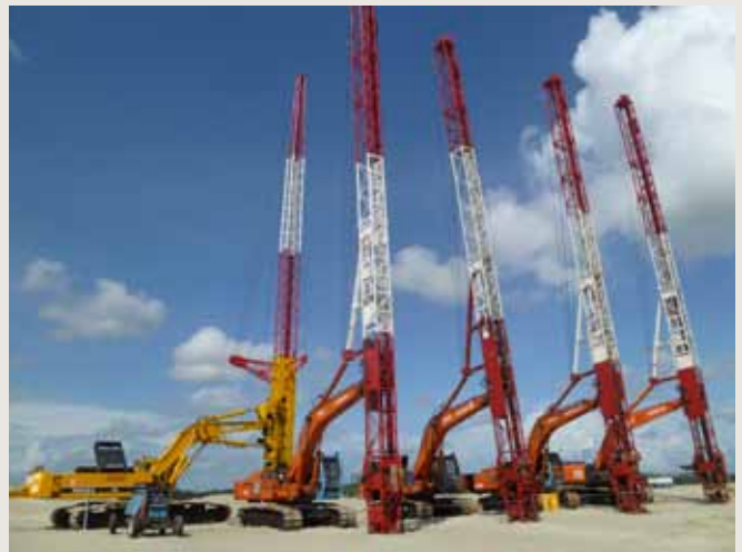
Prefabricated Vertical Drain installation rigs