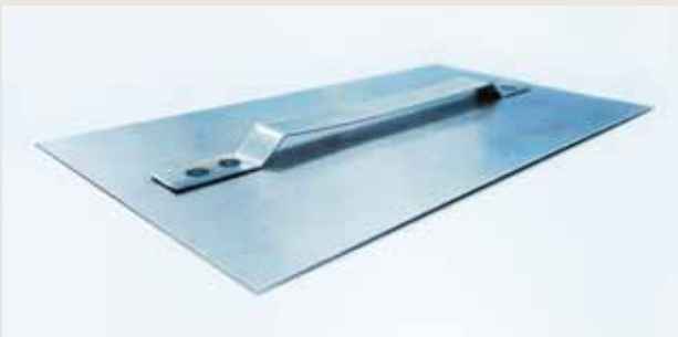
Metal shoe for Alidrain® PVD's