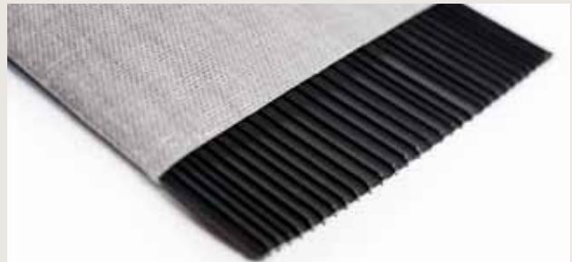
Alidrain® Prefabricated Vertical Drain

1 CIRIA (1991) "Prefabricated Vertical Drains", Butterworth-Heinemann, U.K.