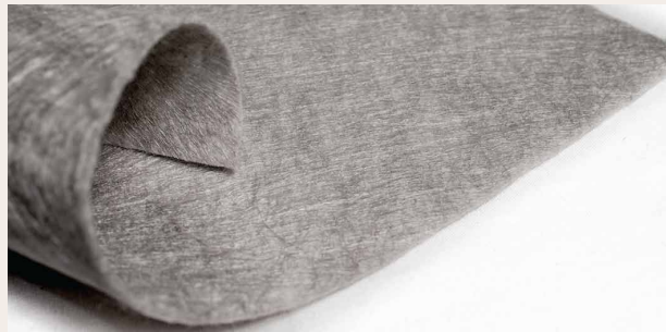
TenCate Polyfelt® TS & KET nonwoven geotextile.

A geotextile separator prevents the intermixing of two contrasting layers of material in road construction e.g. aggregate base course material and soft fine grained subgrade material. Without a geotextile separator the aggregates will punch into the soft subgrade; the net result being the compaction of the aggregates to achieve a target CBR value may not be achieved and additional base thickness is required to compensate for the loss of good aggregate into the subgrade. An effective geotextile separator also requires high permeability to allow rapid dissipation of excess pore pressures built up during transient wheel load passes. Polyfelt® nonwoven geotextiles are robust geotextile separators with high permeability to allow rapid dissipation of any excess pore pressures that built up during the course of construction and over the service life.