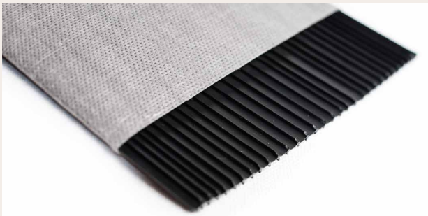
TenCate Polyfelt® AD.

TenCate has the capability to supply large quantities of Polyfelt® Alidrain PVD to fast-paced projects that require the delivery of the drains within a tight schedule. Its track record in high profile projects is a testament of its reliability to supply high quality and cost effective PVDs for soft soil consolidation projects.