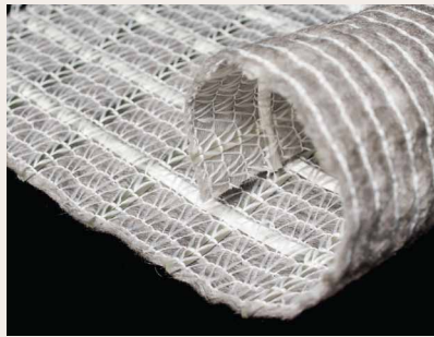
TenCate Polyfelt® PGMG.